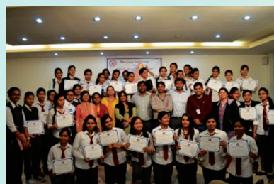
One Day Workshop on MATLAB Application