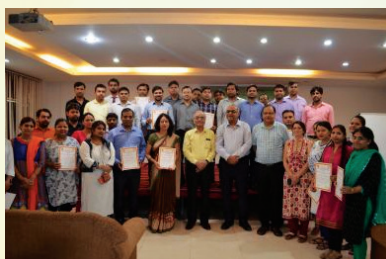
One day FDP by IIT Bombay on SCILAB.