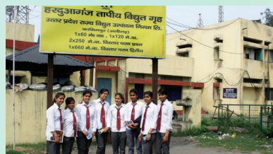
Industrial Visit at "Harduaganj Power Station"