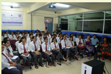
One day workshop by IIT Bombay on College to Corporate Program.