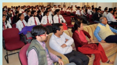
Conducted workshop on Designing of Micro strip patch antenna

The Department of Electronics & Comm. Engg. comprises of all the latest & modern facilities. The department is equipped with all the labs as per the curriculum. The various labs being the CAD lab, Advance Electronic lab, Integrated circuit lab (with latest Texas instrument kit), Antenna and Microwave Lab, Communication Lab etc.