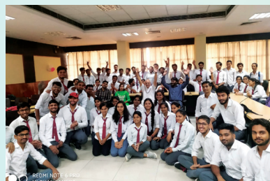
Industrial Visit at BSNL ALT Centre Ghaziabad