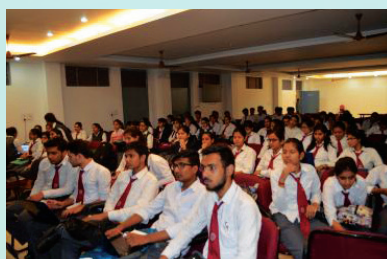
One Day workshop on Digital Marketing