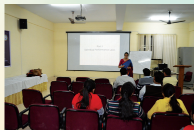
One week FDP on Computational Complexity.