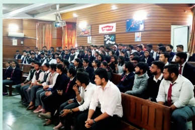
Industrial Visit at Parle Bahadurgarh.