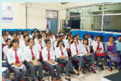
One day workshop on "C and C++"