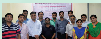
Conducted 5 Days FDP on "Electrical Power System"